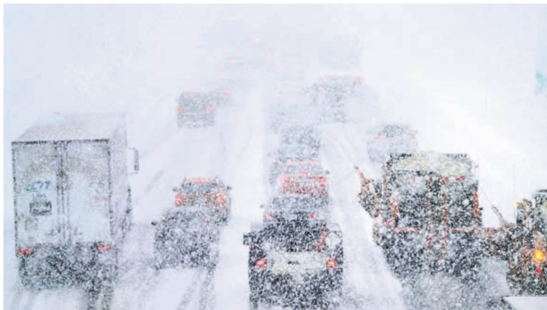
Plows, at right, try to pass nearly stopped traffic, due to weather conditions, on Route 93 South, Tuesday, March 14, 2023, in Londonderry, N.H.

Some of the highest snow totals reported were 35 inches (89 centimeters) in